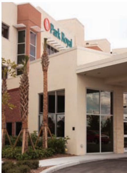
The recently opened Park Royal is the only mental-health hospital in Lee County.

BY ATHENA PONUSHIS aponushis@floridaweekly.com